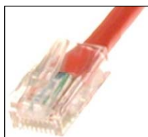
No Boot Style