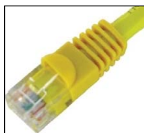
Flush Bump Style